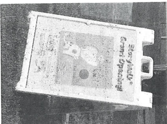
Sign leads way to StoryWalk area unveiled Wednesday at Hamilton Reservoir in Palatine. Right photo: Families, children, parents, grandparents and others take part in activities celebrating opening of the Palatine Library's StoryWalk.