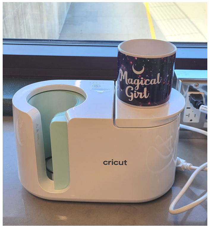
Sample pictures of the HPN mug press and Cricut mug press.